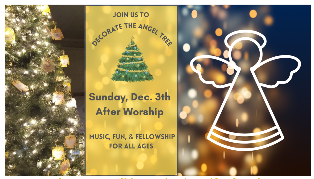
Angel Tree - We'll be gathering gifts for The Christmas Shop and Coat Boston. Please see centre-church.org for Angel Tree gift suggestions.